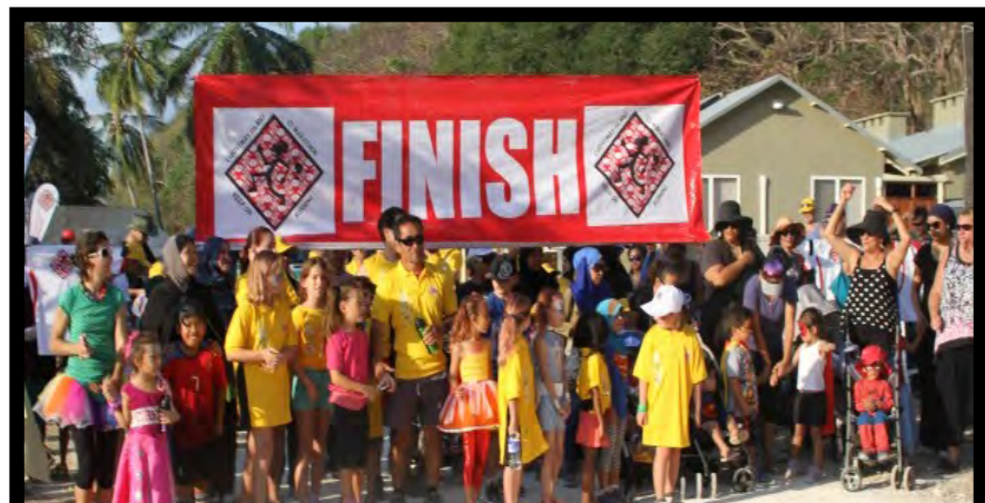
Left: Super Heroes are Go