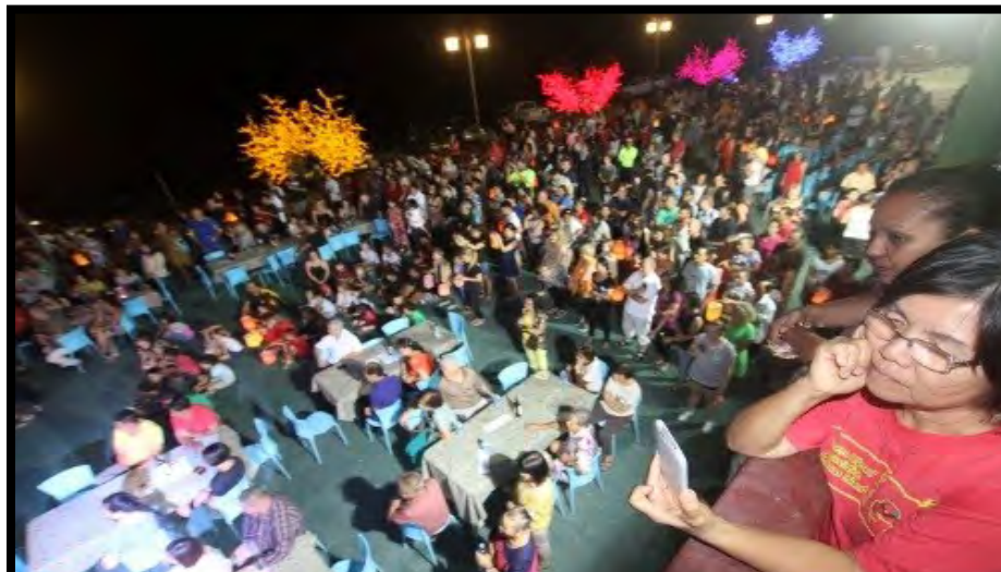
Top View Of the Festival From the Balcony