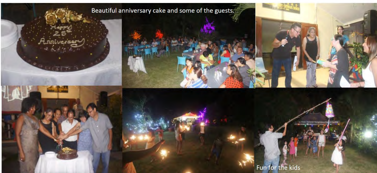
Beautiful anniversary cake and some of the guests.